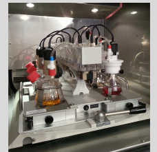
RAMOS coupled to SFR platform (Kühner AG)

Culture platform: 250mL disposable shake flasks coupled to RAMOS-System 4 and SFR 5 . On-line measurements of pH, dissolved oxygen (DO), oxygen transfer rate (OTR), carbon dioxide transfer rate (CTR) and respiratory quotient (RQ) were available.